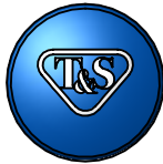
018506-19NS Blue Index (Qty = 1 ea.)