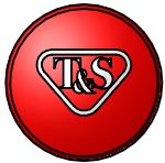
001193-19NS Red Index (Qty = 1 ea.)