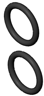
(2) Heat Resistant O-Rings