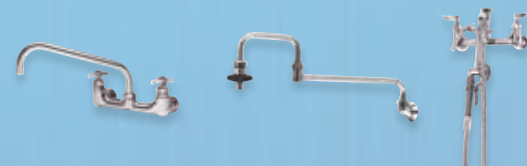
Pot and Kettle Filler