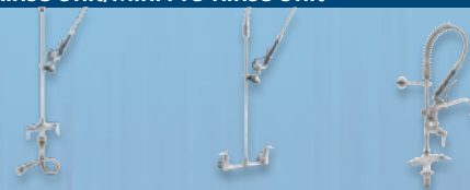
Pre-Rinse Unit/Mini Pre-Rinse Unit