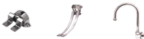
Pedal and Knee Valves