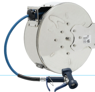
B-7142-C05 HOSE REEL