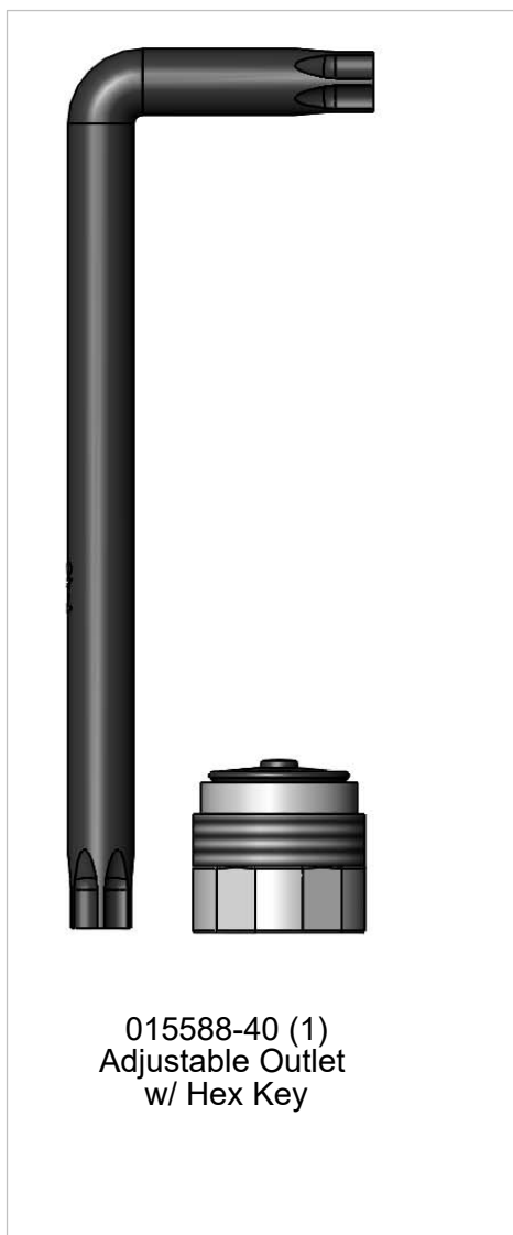
015588-40 (1) Adjustable Outlet w/ Hex Key