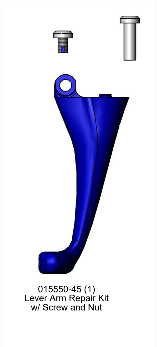
015550-45 (1) Lever Arm Repair Kit w/ Screw and Nut

Product Specifications: Glass Filler Repair Kit