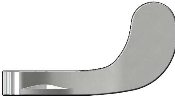
B-WH4-NS 4" Wrist Action Handle QTY = 1