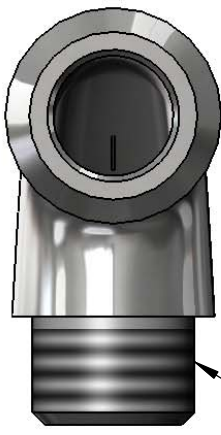
1/2" NPT Male Thread