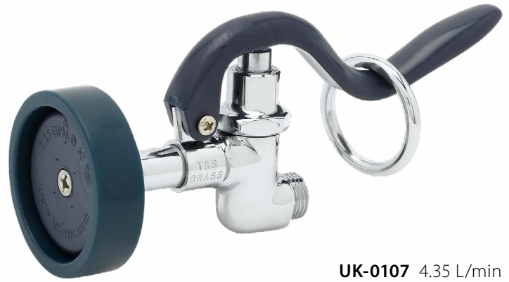
UK-0107 4.35 L/min

It is the blue international version of our #1 top-selling B-0107 pre-rinse spray valve and has the same "cat eye" spray pattern with a single spray point to create higher force to allow for faster cleaning; Ideal for when you need a superior quality spray valve suited for most general applications with a focus on sustainability, and want it to be backed by decades of trusted satisfaction.