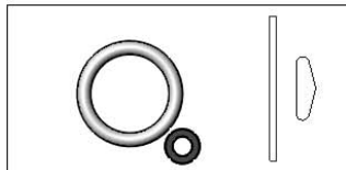
Hold Down Ring & Washer (Included)