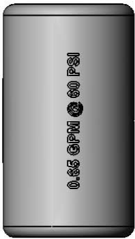
018292-45 Shield (Qty 2)