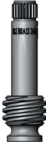
001907-25 Removable Eterna Spindle Insert w/ Check, RTC (Qty=1)