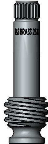
001908-25 Removable Eterna Spindle Insert w/ Check, LTC (Qty=1)

Product Specifications: Replacement Kit For Eterna Cartridge w/ Spring Check Spindles (RTC & LTC)