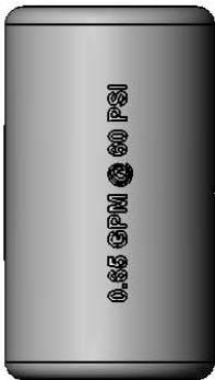
002659-45 Shield (Qty 2)