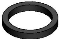
001040-45 Washer Qty = 4 ea.