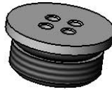
END PLUG ASSEMBLY(1)