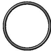
006562-45 O-Ring (4) Supplied