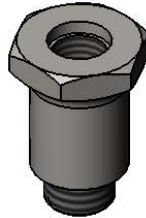
000821-40 Spring Body (Qty 1)