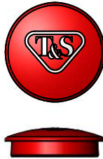
001193-19NS Red Handle Index (1)