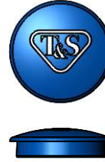
018506-19NS Blue Handle Index (1) Supplied