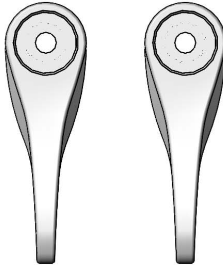
001638-45NS-AM Anti-Microbial Coated Lever Handle (2) Supplied