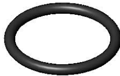
002721-45 O-Ring (Qty 2)