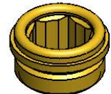
000764-20 Seat (Qty 2)