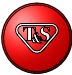
001193-19NS Red Index (Qty = 1 ea.)