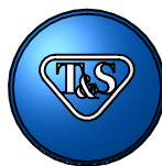
018506-19NS Blue Index (Qty = 1 ea.)