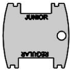
015425-45 Vandal Resistant Key