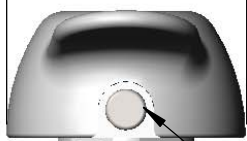
Vandal Resistant Screw