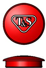
001193-19NS Red Handle Index (1) Supplied