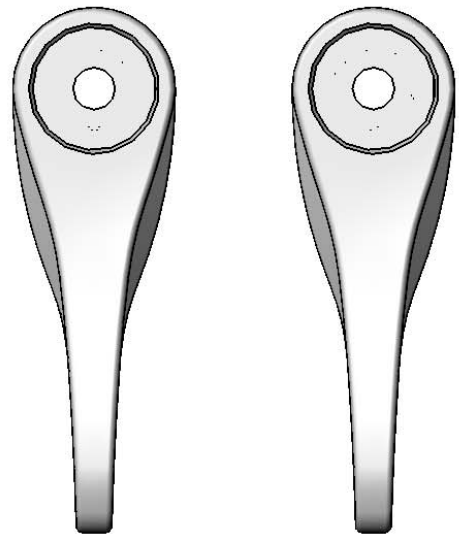
001638-45NS Lever Handle (2) Supplied

Product Specifications: Lever Handle Parts Kit