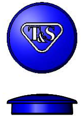
018506-19NS Blue Handle Index (1) Supplied