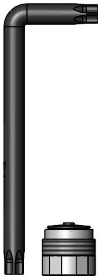
015588-40 (1) Adjustable Outlet w/ Hex Key