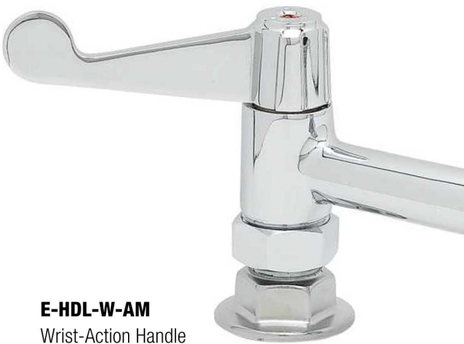
E-HDL-W-AM Wrist-Action Handle