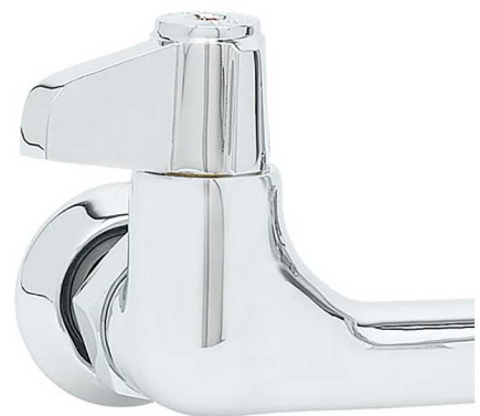
E-HDL-L-AM Lever Handle