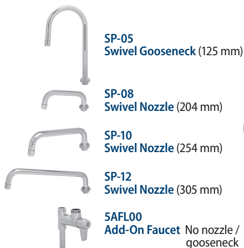
SP-05 Swivel Gooseneck (125 mm)