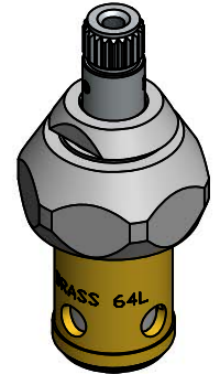
RTC Hot Cartridge