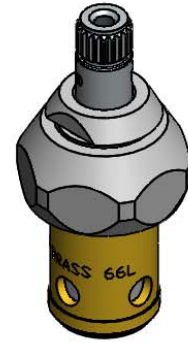
LTC Cold Cartridge