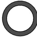
002601-45 Gasket (25 Supplied)