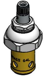
Hot Spindle (Assembled Item Shown for Clarity)