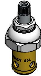
Cold Spindle (Assembled Item Shown for Clarity)