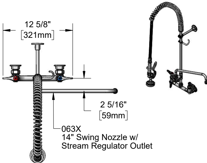
063X 14" Swing Nozzle w/ Stream Regulator Outlet