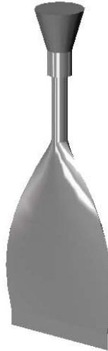
010588-45 Thread Locking Compound