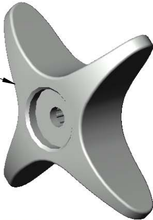
002521-45NS 4-Arm Handle