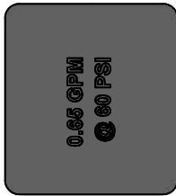
002659-45NS Shield (Qty 2)